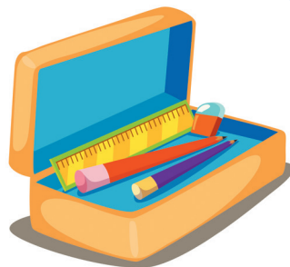
pencil case пенал